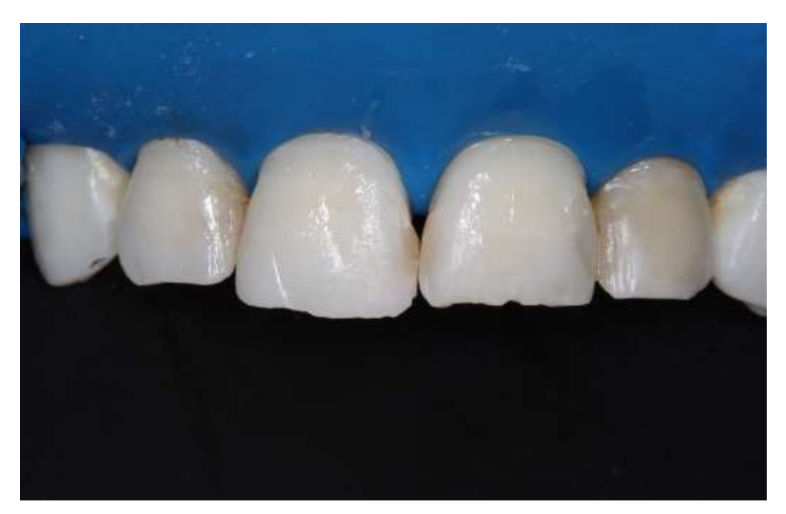
Figure 5: Final aspect of the front teeth after resin infiltration. Due to similarity of refractive index between hydroxyapatite and Icon Infiltrant®, the white spot lesion diminishes.