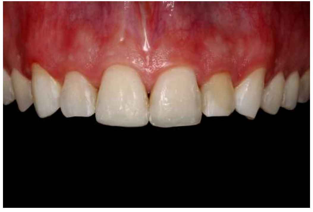
Figure 6: Final aspect of the teeth after composite resin restoration. The white spot lesions and the chipped incisal edges were properly treated.