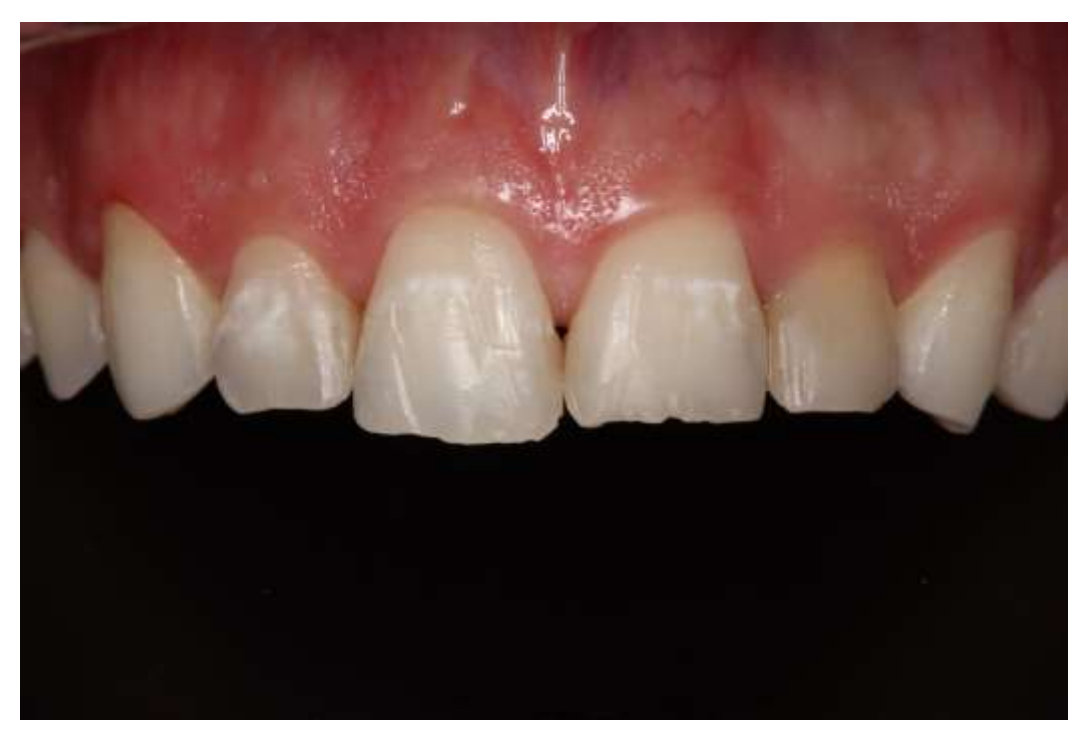
Figure 1: Initial aspect of the patient's maxillary front teeth. White spot lesions can be seen on the central incisors and right lateral incisor, as well as their chipped incisal edges.

A 33-year-old male patient sought the local clinic complaining about the white spots present in the buccal surface of his maxillary central incisors and right maxillary lateral incisor and wear of the incisal edges of his front teeth (Figure 1).