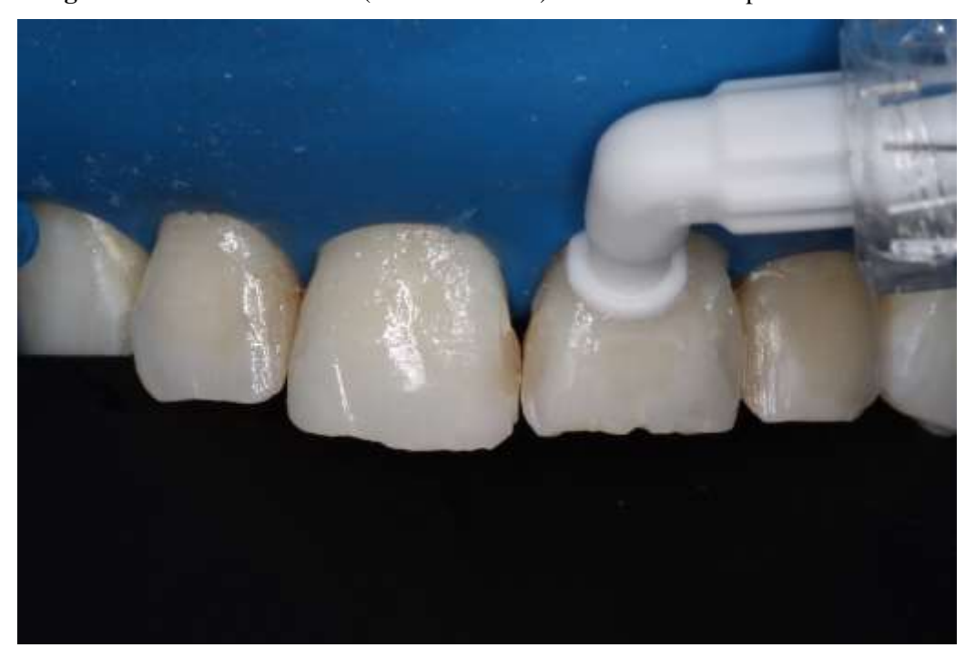
Figure 4: Infiltration of resin (Icon Infiltrant®) within the white spot lesion.