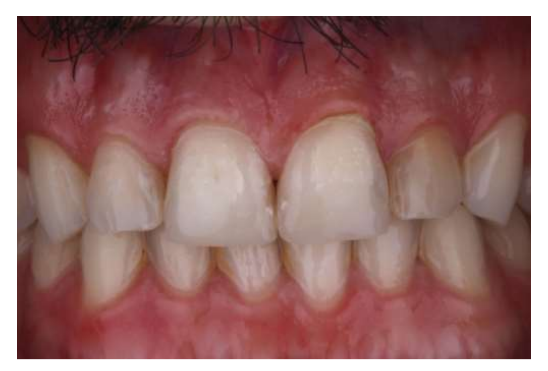
Figure 7: Follow-up after 2 years. Proper aesthetics provided by the masking ability of the resin infiltrants and the composite resin on the incisal edges of the central incisors and right lateral incisor.

After two years, the patient was reassessed and no tooth discoloration or chipping of the restoration was noticed. Therefore, polishing of the restoration was conducted (Figure 7). The patient also reinforced that he no longer felt any facial discomfort due to sleep bruxism.