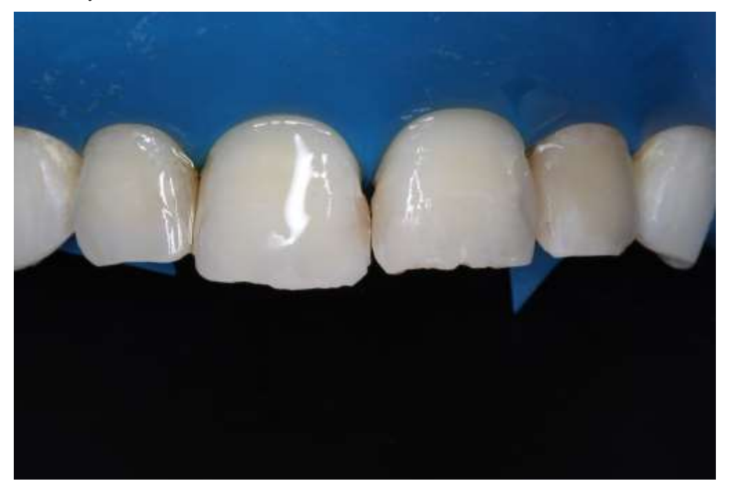
Figure 3: Drying the enamel by inserting ethanol (Icon Dry®) inside the pores of the white spot lesion in order to remove water. Discoloration diminished after applying Icon Dry®.